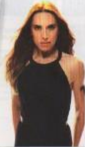
TABLE FOR TWO TRULY MADLY DEEPLY RELATIONSHIPS REAL LIFE LIFE LESSONS: MEL C FICTION: ALL SHE WANTS TRAVEL: ICELAND PROPERTY HOW GAY ARE YOU? DENISE WELCH

For A/W12, McQ's menswear collection takes inspiration from quintessential British traditions and outdoor pursuits, with references including the military and the great outdoors. This combined with its trademark nods to mod, skinhead and punk subcultures has resulted in a collection that captures youth and irreverence. Outerwear is key, including bomber jackets, fur-trimmed parkas and leather bikers in military khaki and oxblood with flashes of McQ urban.