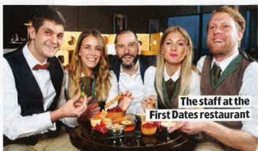
The staff at the First Dates restaurant

Do you think a restaurant is a good place for a first date? Wouldn't it be better to go for a drink with a quick escape route? Going for a meal forces you to take the time for the date, which is something people never do. When you take the time relationships blossom and flourish.